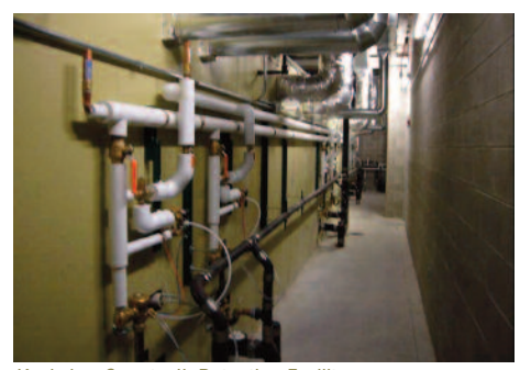
Kankakee County, IL Detention Facility – Rear chase mechanical corridor with identical connections