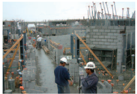
CMU block construction site - Exposed to weather and subject to delays

TrussCore is a truncated, triangular-shaped, roll-formed steel truss that spans the full width and height of TrussWall panels.