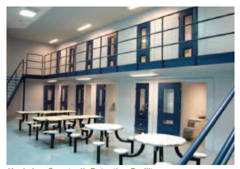
Kankakee County, IL Detention Facility – Finished TrussWall cells